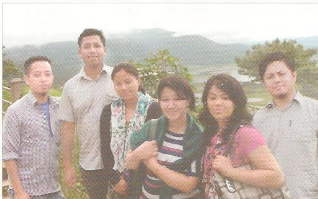
Present Staff of KVK, East Khasi Hills

Editor Programme Co-ordinator i/c KVK, East Khasi Hills Upper Shillong