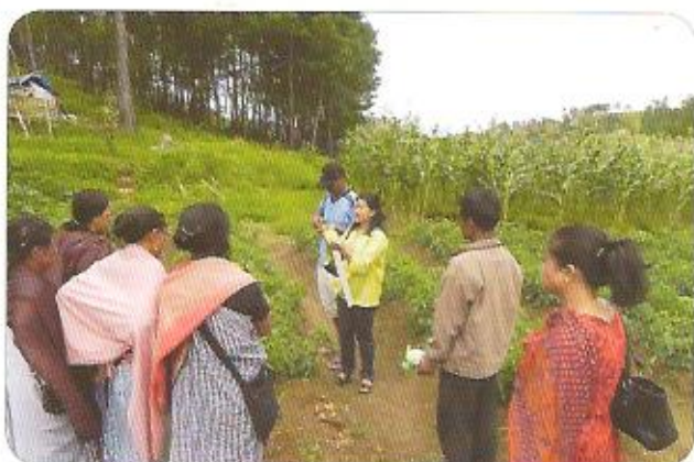
Demonstration on use of Pheromone trap at Mawryngkneng