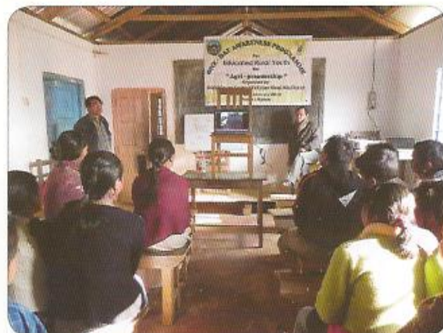
Training programme at Mawphlang