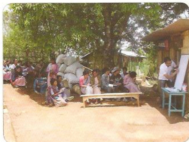
OFT Training at Diengpasoh

On farm trials were conducted in Diengpasoh village on "Integrated Disease Management" in Ginger by the use of bio-organic formulation "GF-2" to control soft rot diseases. The results of these trials are awaiting. The centre has also taken up trials on System of Rice Intensification (SRI) at Lwang and Lyngkien villages where the results are awaiting completion.