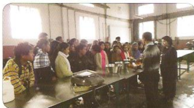
Exposure trip to Fruit Processing Unit