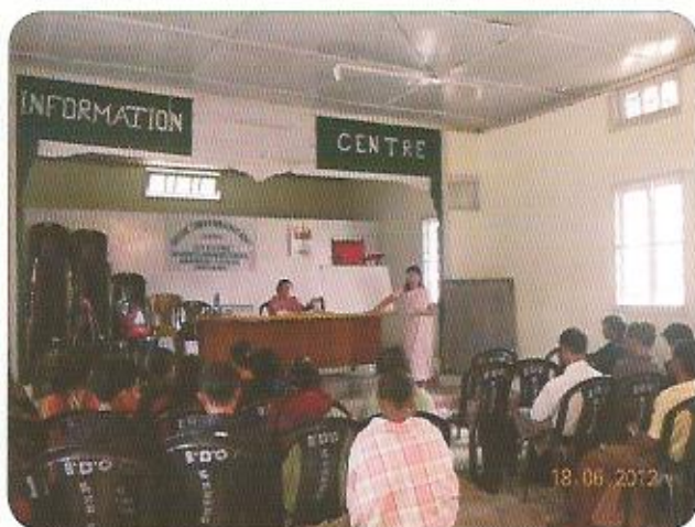
Training Programme conducted in convergence with ATMA