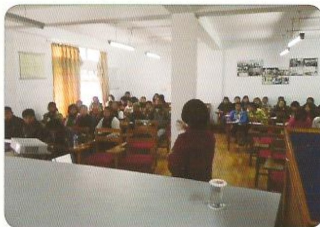
On campus training