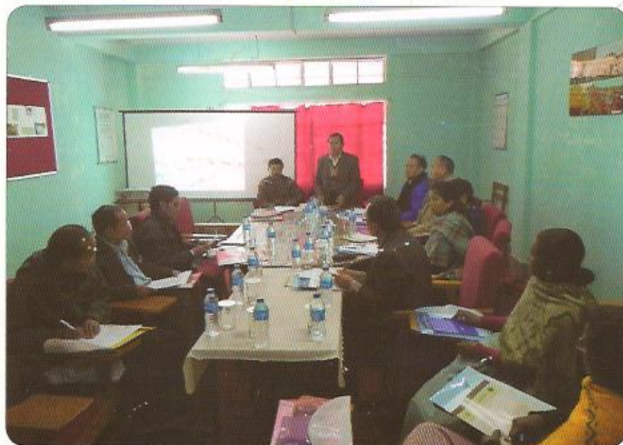
3rd Scientific Advisory Committee (SAC) meeting