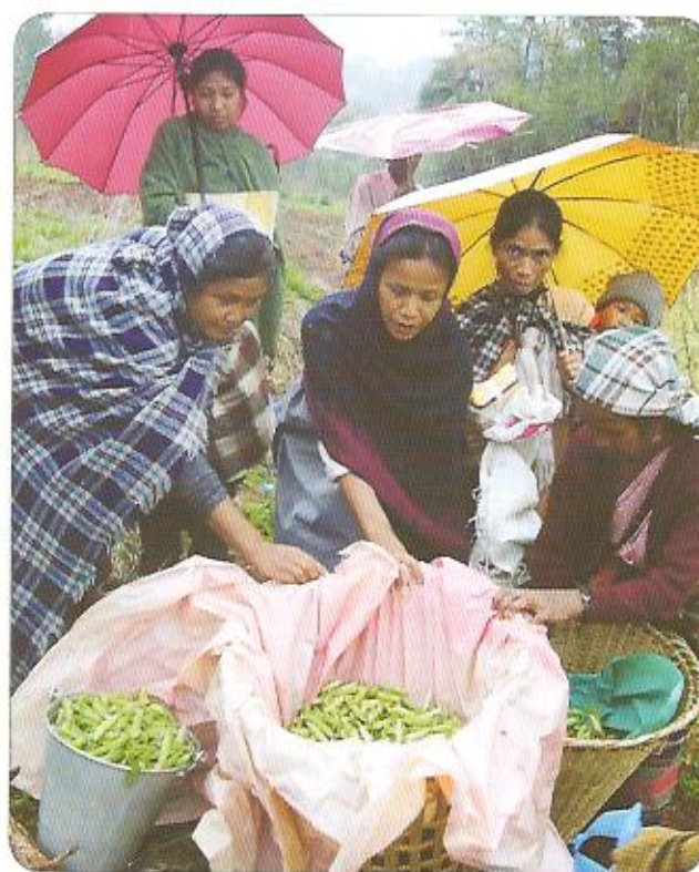
Harvested Pea crop in farmers' field