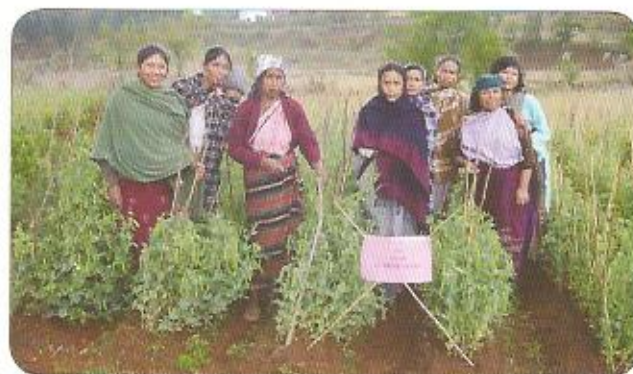
FLD on pulse (Imported pea) at Laitjem