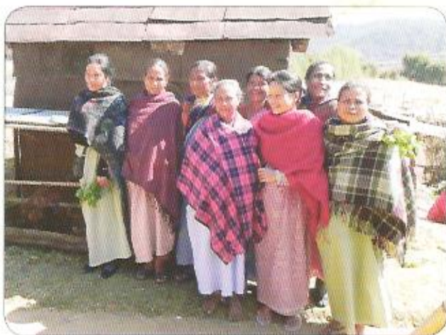
Visit to Tyllilang SHG at Baniun