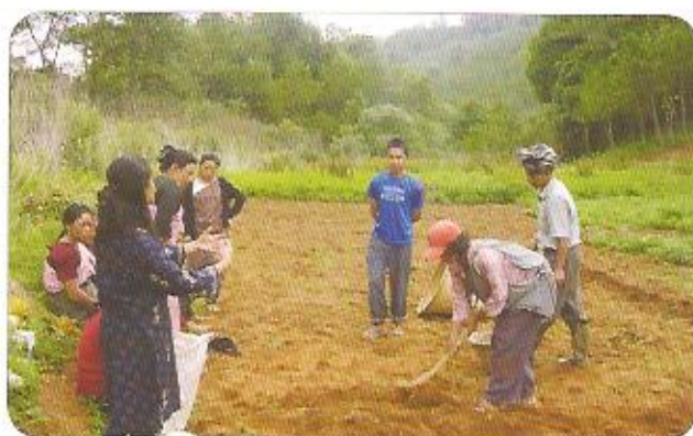
FLD on Maize at Laitjem