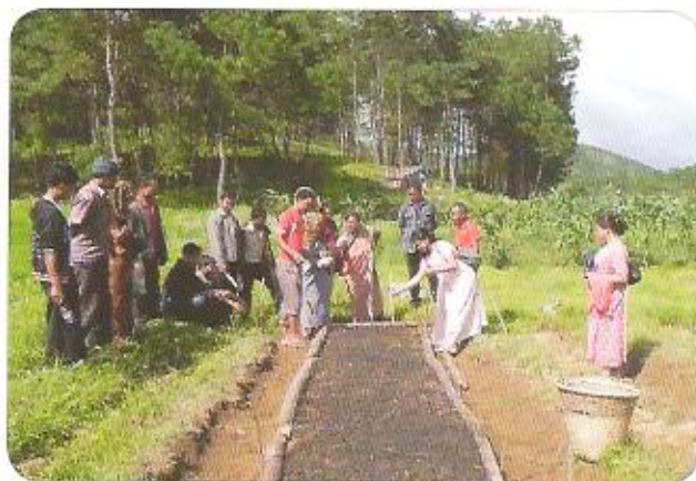
Nursery raising under SRI method at Lwang

line demonstration was also conducted at Laitjem village on Pulse crop Pea (Imported pea) and this demonstration shows encouraging results and farmers are willing to use this variety in the next cropping season.