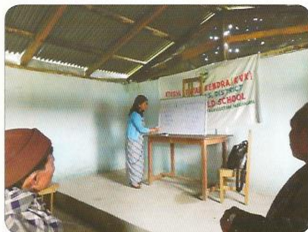
Training programme at Thynroit