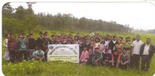
Participants of World Environment Day