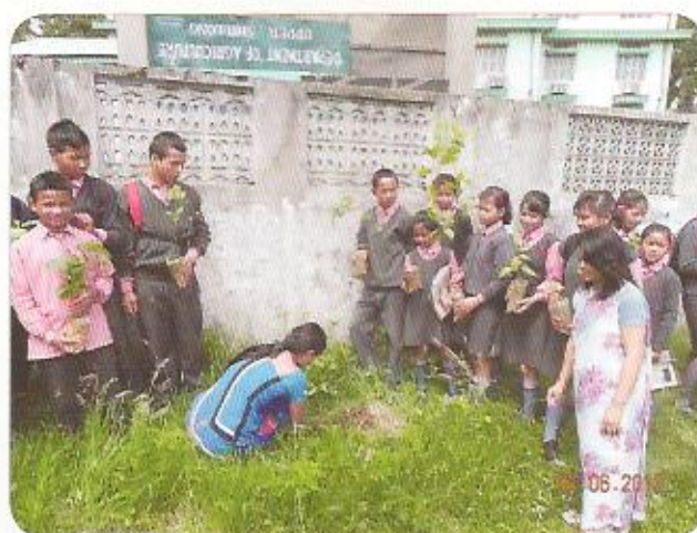
Tree saplings Plantation on World Environment Day