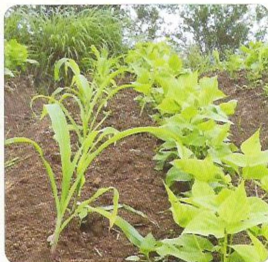
Maize intercropped with French Bean at Sadew

Front line demonstrations were taken up in some selected operational villages on Ginger and Maize crop. Popularization of ginger (Vareda) was conducted at Diengpasoh village. Another demonstration on Maize intercropping with French bean was conducted at Sadew, Laitjem and Mawryngkneng villages. The use of Pheromone trap against Tomato fruit Borer ( Helicoverpa armigera ) was conducted in Mawryngkneng. The results of all these demonstrations are awaiting. Front