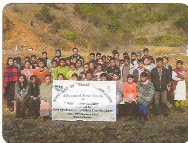
Awareness Programme on Agri-preneurship at Kyiem